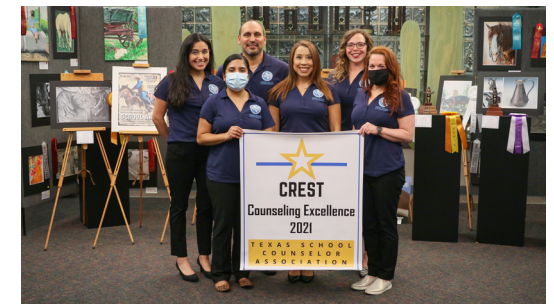
High School CREST Award winner