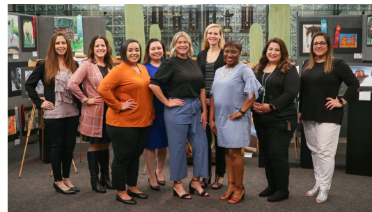
Intermediate School CREST Award winners