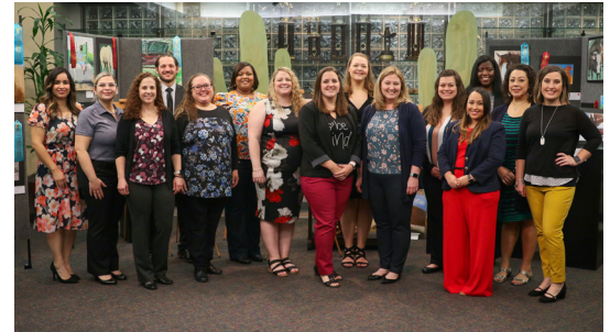
Middle School CREST Award winners