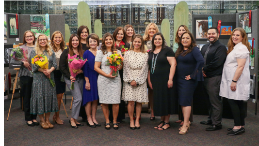
Elementary School CREST Award winners

Pasadena ISD Board of Trustees recognized the 2021-2022 Counselors Reinforcing Excellence for Students in Texas (CREST) award winners. This year, 34 counselors received the CREST award for their campuses.