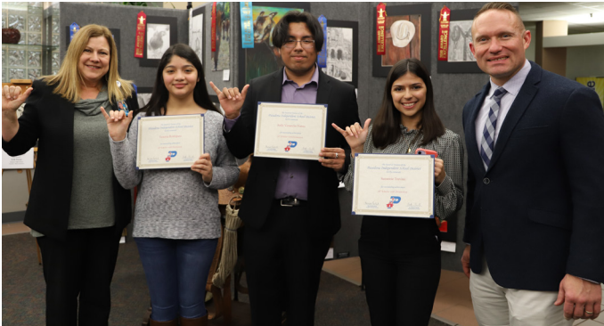
Pasadena Memorial High School AP Scholars with Distinction

The Pasadena ISD Board of Trustees recognized 34 students who qualified as AP Scholars with Distinction. The distinction is awarded by College Board to students who average a minimum score of 3.5 on a five point scale on all their AP exams and score 3 or more on at least five of these exams.