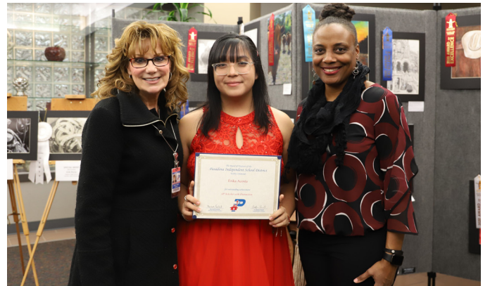
South Houston High School AP Scholar with Distinction