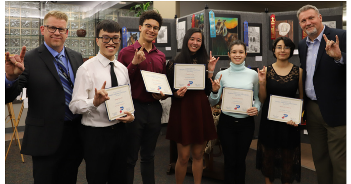
Dobie High School AP Scholars with Distinction