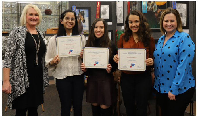
Sam Rayburn High School AP Scholars with Distinction