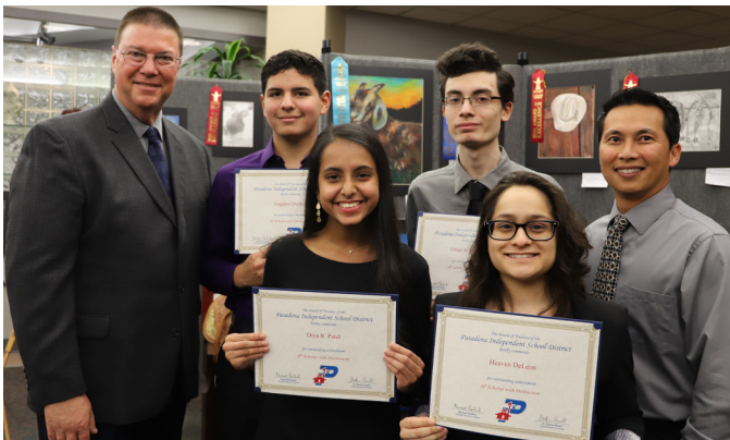
Career & Technical High School AP Scholars with Distinction