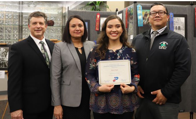
Pasadena High School AP Scholars with Distinction