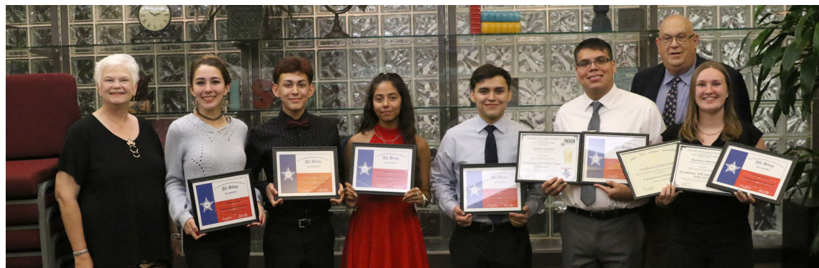
At the board meeting, students who were named to Academic All-State Swimming and Diving Teams for 2019-2020 by the Texas Interscholastic Swimming Coaches Association (TISCA), Texas High School Coaches Association (THSCA), and Texas Girls Coaches Association (TGCA) were honored for their high academic standards for their high school years and for their athletic success during the current season.