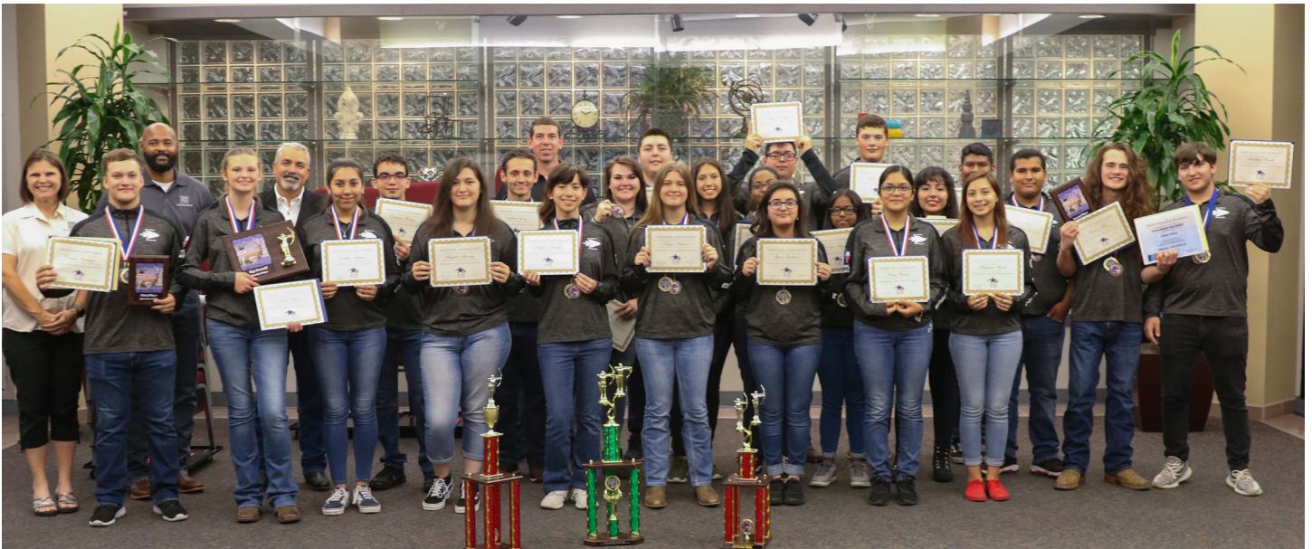
The 24-member Pasadena Memorial High School Archery Team was recognized at the board meeting for advancing to national competition in 2D and 3D archery, held in Salt Lake City, UT.