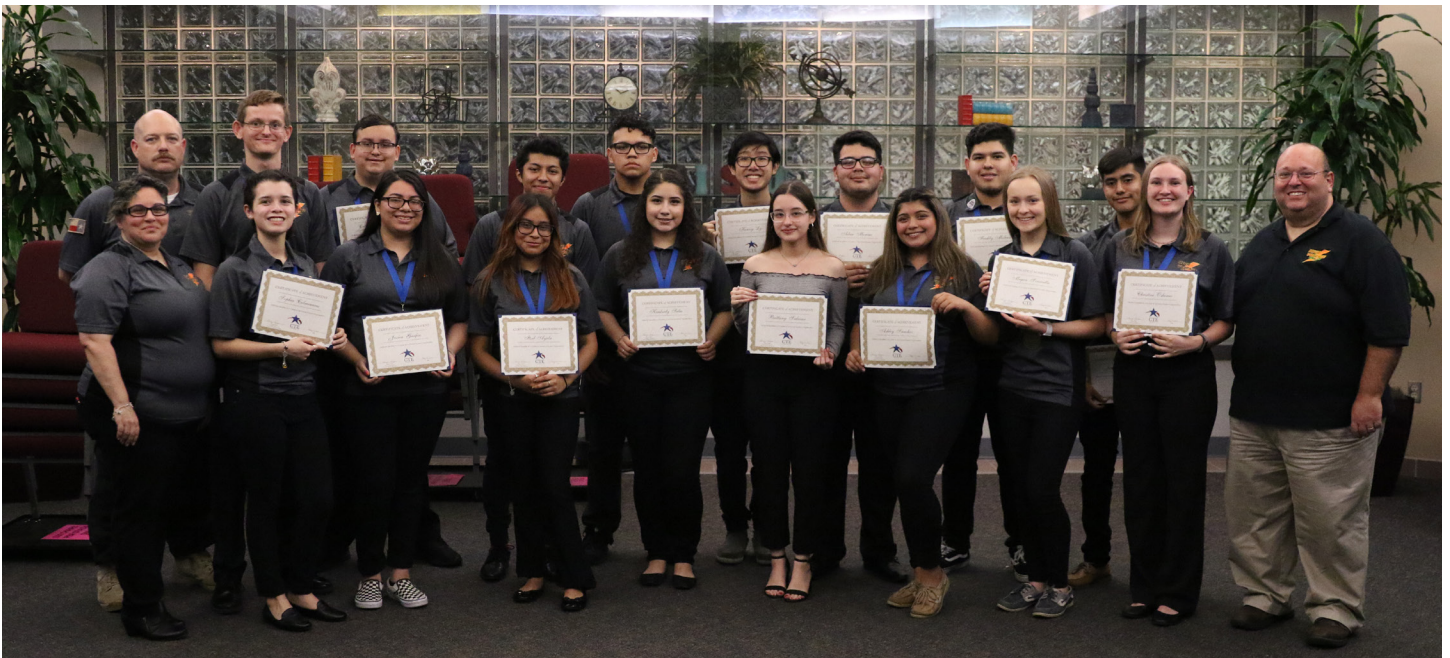
Also recognized at the board meeting was the Pasadena ISD robotics team which is comprised of 32 students from three different high schools. The team recently advanced to the FIRST World Robotics Championship in Houston on April 17-20, 2019.