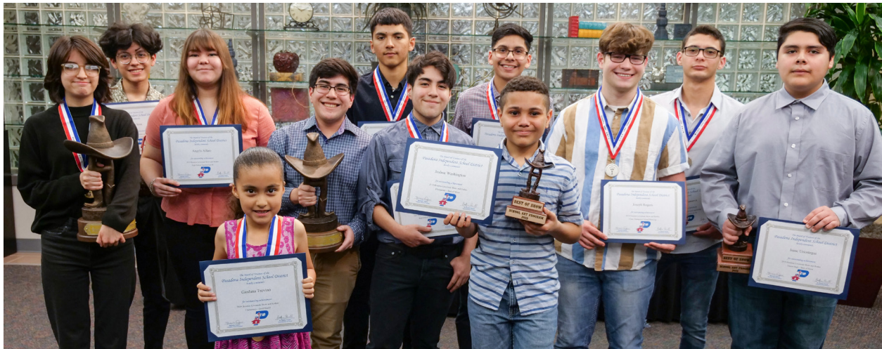
The Pasadena ISD Board of Trustees recognized art students for earning $651,000 at the 2019 Houston Livestock Show and Rodeo.