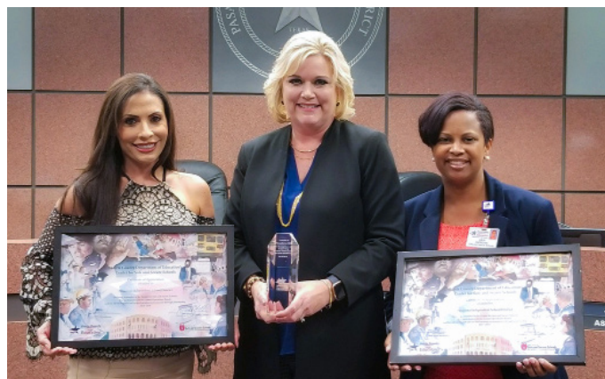
The Harris County Department of Education (HCDE) presented Pasadena ISD with two recognition awards for being a member of the Center for Safe and Secure Schools, participating in the Center Operations Board and for advancing safe and secure learning environments through the partnership. The district received the award for both the 2017-18 and 2018-19 school year.