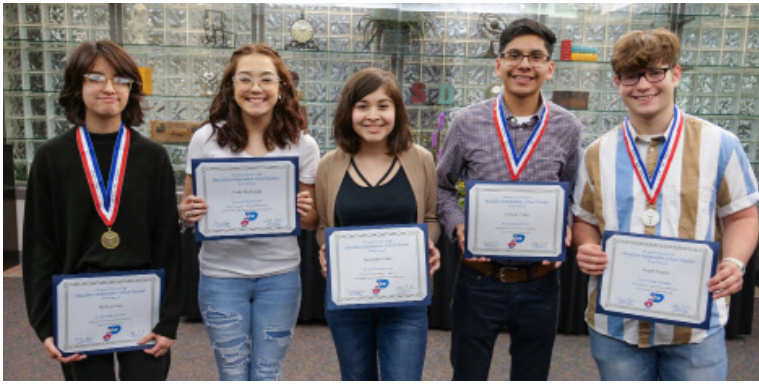
The Board recognized Pasadena ISD art students who participated in the Austin Texas Fair and Rodeo Art Competition.