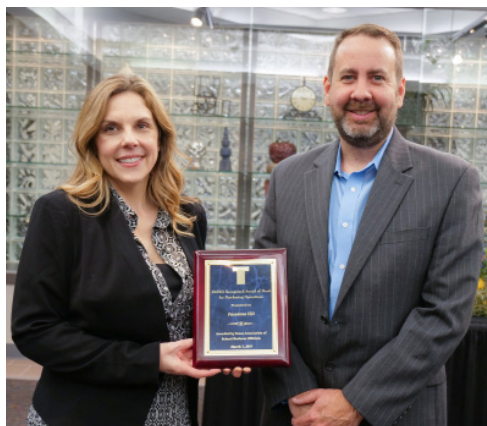
The Board recognized the Pasadena ISD purchasing department for receiving the Texas Association of School Business Officials (TASBO) Award of Merit by achieving excellence in purchasing operations.