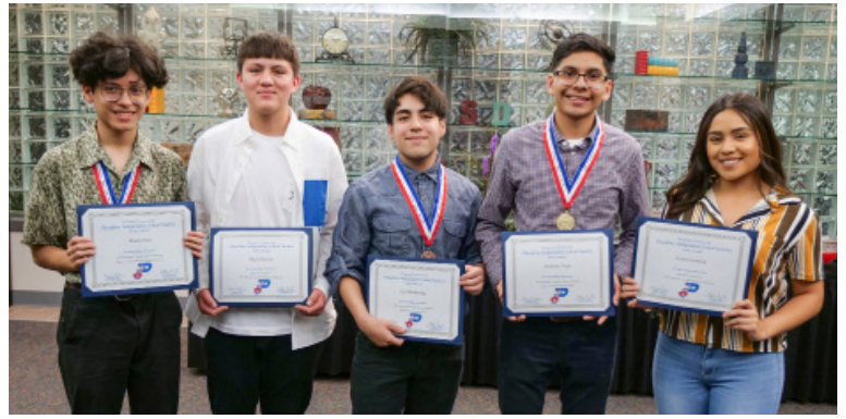
The Board recognized Scholastic Art Award winners from across the district.